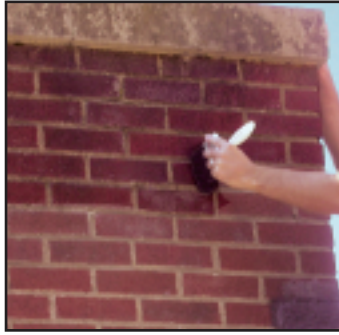
Apply DRYLOK® 5% SILICONE generously with a brush.